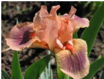
'Absolute Joy' (Aitken 2006)

For our first TB Open Garden, four weeks later, we were blessed yet again with a warm and sunny day. With almost 100 TBs and Siberians in bloom, our garden was awash with colour...in fact earlier in the week a neighbour, poking his head over the fence, commented on this fact. Contributing to this was the Dykes Memorial Medal collection. Just over half of the 77 irises in this collection were in full bloom with each plant putting out at least two bloom stalks. It was a sight to be seen!